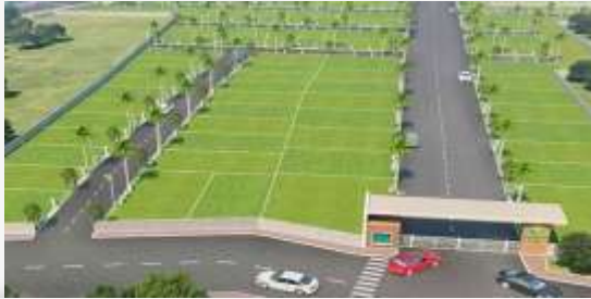
▶ DREAM LATUR CITY