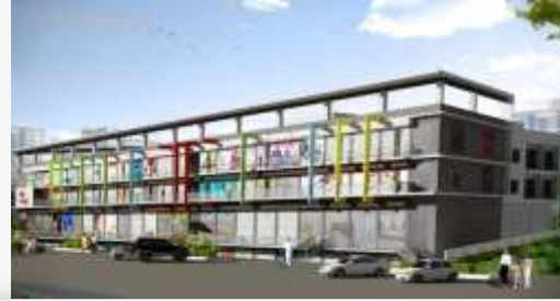
▶ SAI PLAZA